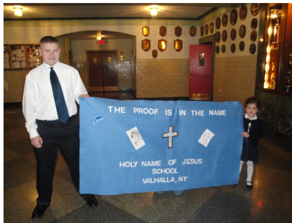
Students representing HNJ at Parent Rally